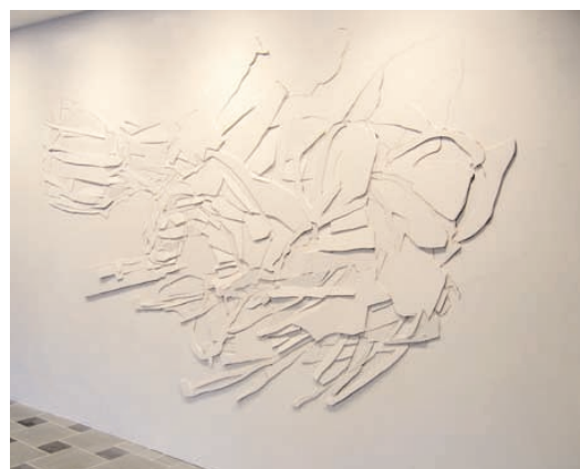
CHRIS NAU, Inhabit XVI , 2008. Graphite and cuts on drywall, 96 x 192 inches.

The works presented in Apparently Invisible skirt the edge of perception, subtly recalibrating our experience of seeing. In some cases, the artworks are physically hard to see, and therefore require a very careful kind of inspection, a literal double take. In other works, the materials themselves have been so intricately worked and unconventionally applied that the objects they form become exceedingly difficult to distinguish. Although the artists featured in the exhibition deploy a diverse array of aesthetic strategies, all of them refer to traces of the drawn line as the basis for formal and conceptual explorations of optical experience.