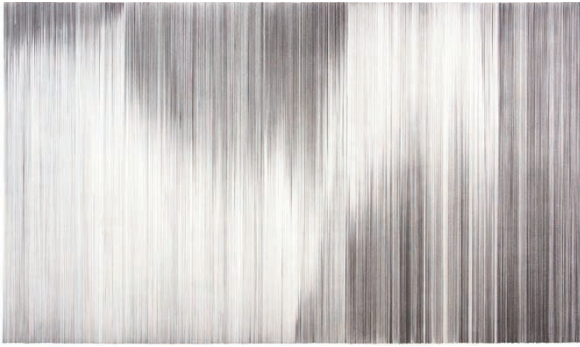
ANNE LINDBERG, parallel 11 (plumbago) , 2007. Graphite on cotton board, 42 x 70 inches.

fabrics such as bedding and carpet. Herzog staples these materials directly into the wall, then tears away much of the fabric, leaving behind threads and remnants of the pattern, creating the effect of a work that is simultaneously present and absent.